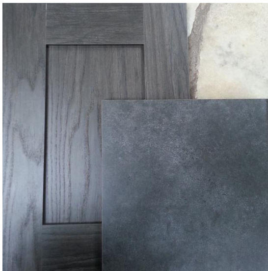
MAIN AND ENSUITE BATHROOMS