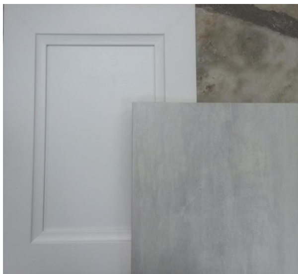
MAIN AND ENSUITE BATHROOMS