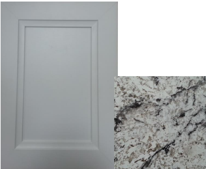
MAIN AND ENSUITE BATHROOMS