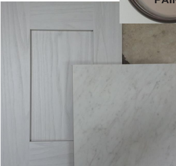
MAIN AND ENSUITE BATHROOM