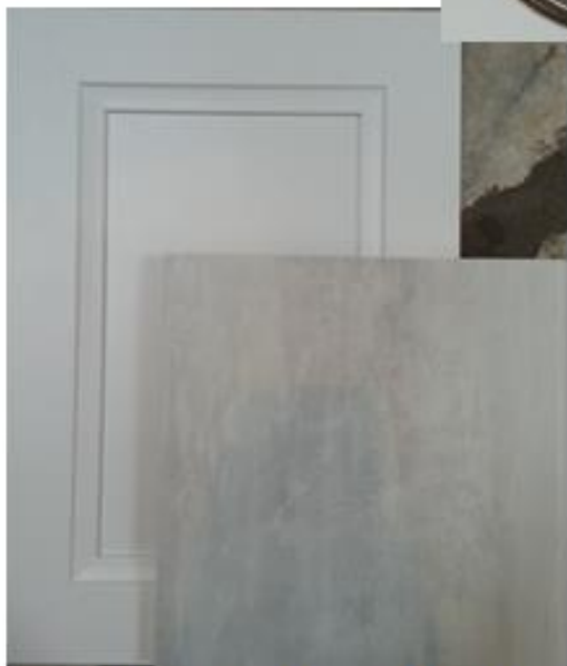
ENSUITE AND MAIN BATHROOM