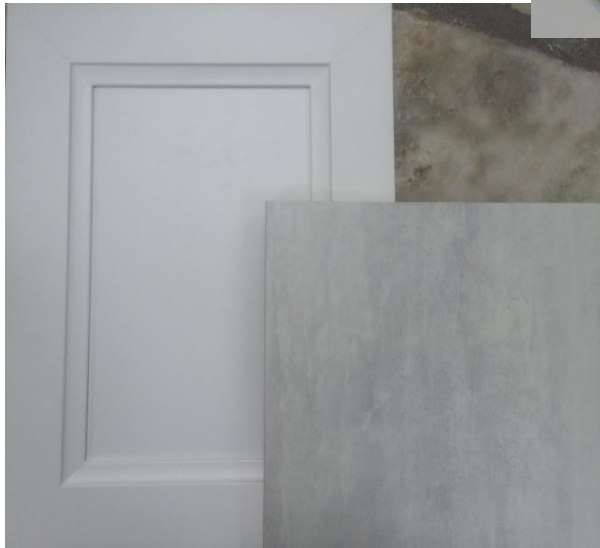
MAIN AND ENSUITE BATHROOMS